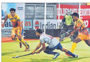
A RCF player (in grey outfit) tries to get the ball past IOB defenders during the 31st Indian Oil Surjit Hockey Tournament at Burdwan Park in Jalandhar on Saturday.